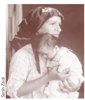
Women and children bear the brunt of war and sanctions.

Food Crisis: In one of the largest logistical operations in world history, over 400,000 metric tons of food are distributed monthly throughout Iraq, providing 2,257 kilocalories per person per day. UNICEF calls the likely war-time collapse of this system a "nightmare scenario."23