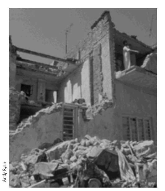
US-led forces destroyed 9,700 houses and rendered 75% of Iraq electrical-generating facilities inoperative in less than two weeks of bombardment.