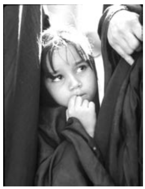
Children as young as four or five years of age have clear concepts of the horrors of war posed by bombs.

Mortality: Estimates of civilian deaths "range from 48,000 to 261,000 for a conventional conflict. If there is civil unrest and nuclear attacks are launched, the range is 375,000 to 3.9 million." The World Health Organization estimates 100,000 direct and 400,000 indirect casualties and anticipates that "as many as 500,000 people could